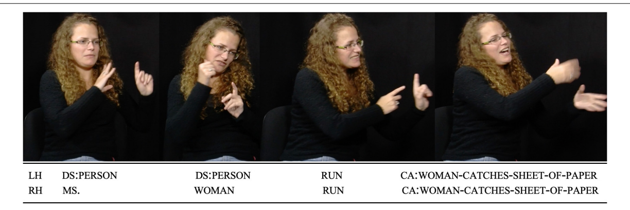
FIGURE 1 LSFB Corpus, Session 29, S059, Task 12: 00:04:00.002 – 00:04:03.895. Reproduced with permission. The woman starts running and catches the sheet of paper, relieved.