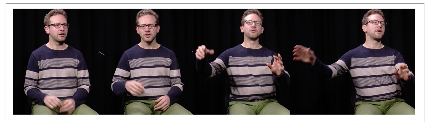
FIGURE 2 | FRAPé Corpus, Session 10, L019, Task 12: 00:00:20.074 – 00:00:21.681. Reproduced with permission. [Il y a une jeune dame aussi qui a l'air de partir au travail] qui qui court après un papier. [There's also a young woman who seems to be leaving for work] who who's running after a sheet of paper.

an Auslan [Australian Sign Language] signer and a speaker in McNeill, 1992).